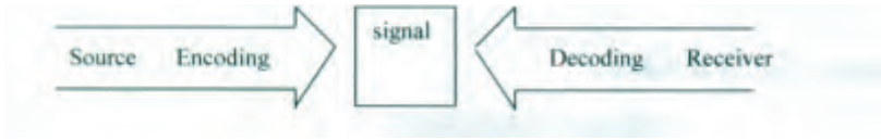
Figure 1: Steps in Communication