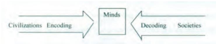
Figure 2: Steps in Peace Communication

Thus the outcome of the convergence of all sources or civilizations is strengthened by the collective will to institutionalize civilization-based societies, which are commonly transmitted by ordinary human minds. This phenomenal drift toward a unifying world can be actualized from the much-awaited global peace structure, in which the global union shall be formed by a benevolent hegemon who will pursue beneficial policies common to all major civilizations for sustainable growth and development.